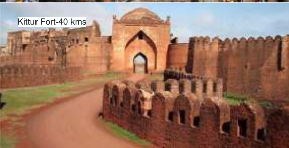
Kittur Fort-40 kms