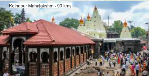
Kolhapur Mahalakshmi- 90 kms