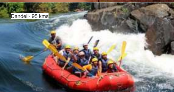
Dandeli- 95 kms