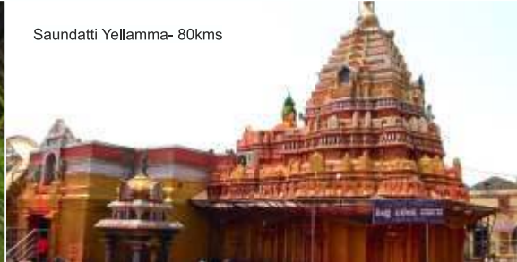
Saundatti Yellamma- 80kms