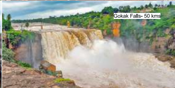
Gokak Falls- 50 kms