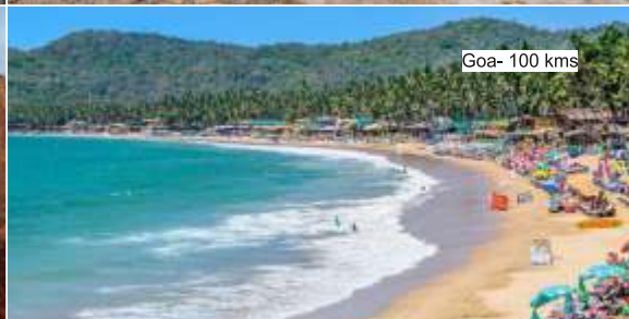
Goa- 100 kms